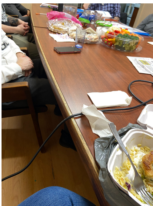
A volunteer training session

Our programs have always relied heavily on the support of volunteers. Volunteers are the connection and often the only connection the people we serve have back into the community. Stigma, discrimination and the resulting social isolation leave folks without a sense of belonging and meaning that being a part of the community brings. Our volunteers are that bridge between. They are also some of the biggest advocates for social change.